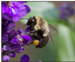
Common Eastern Bumblebee

Georgia is home to some 500 species of native bees! Surprisingly, many of these bees can be found in backyards all around Decatur. Here are a few of the most common ones: