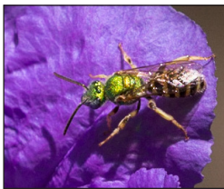
Metallic Green Sweat Bee